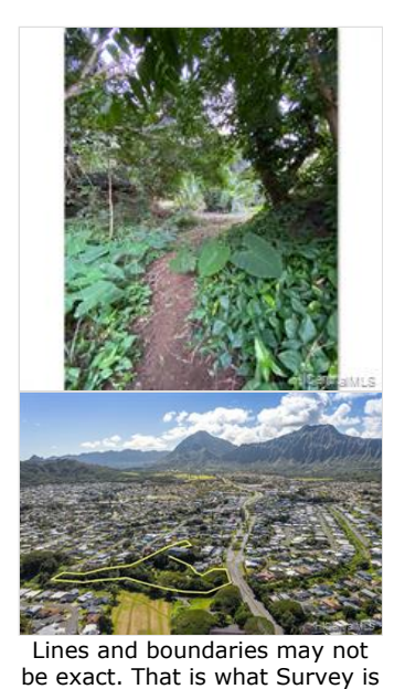
Survey will identify boundary