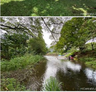
This is the stream that you can see from the lot.